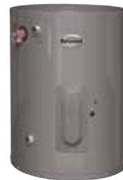
6, 10, 15, 19.9 and 30-Gallon